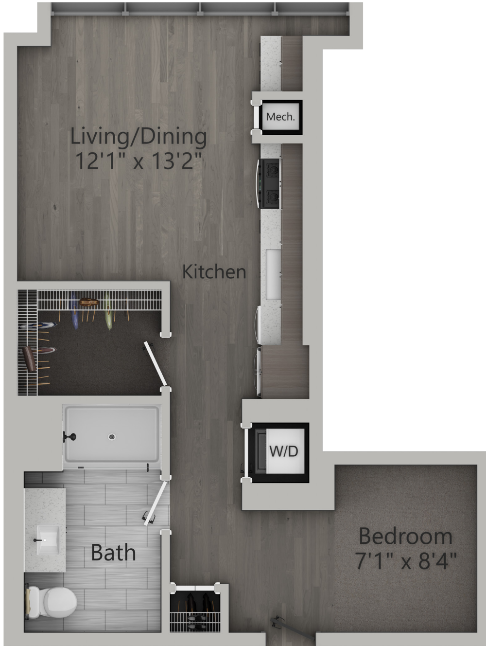
FLOOR 3 N▶