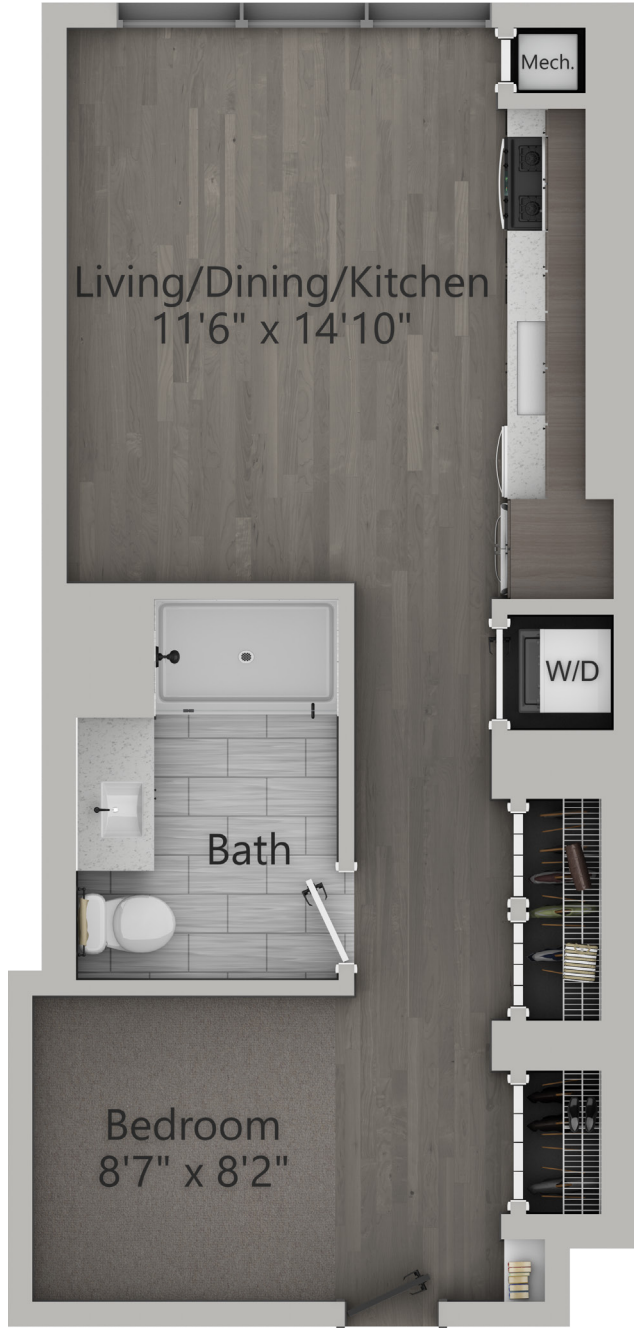
FLOOR 3 N▶