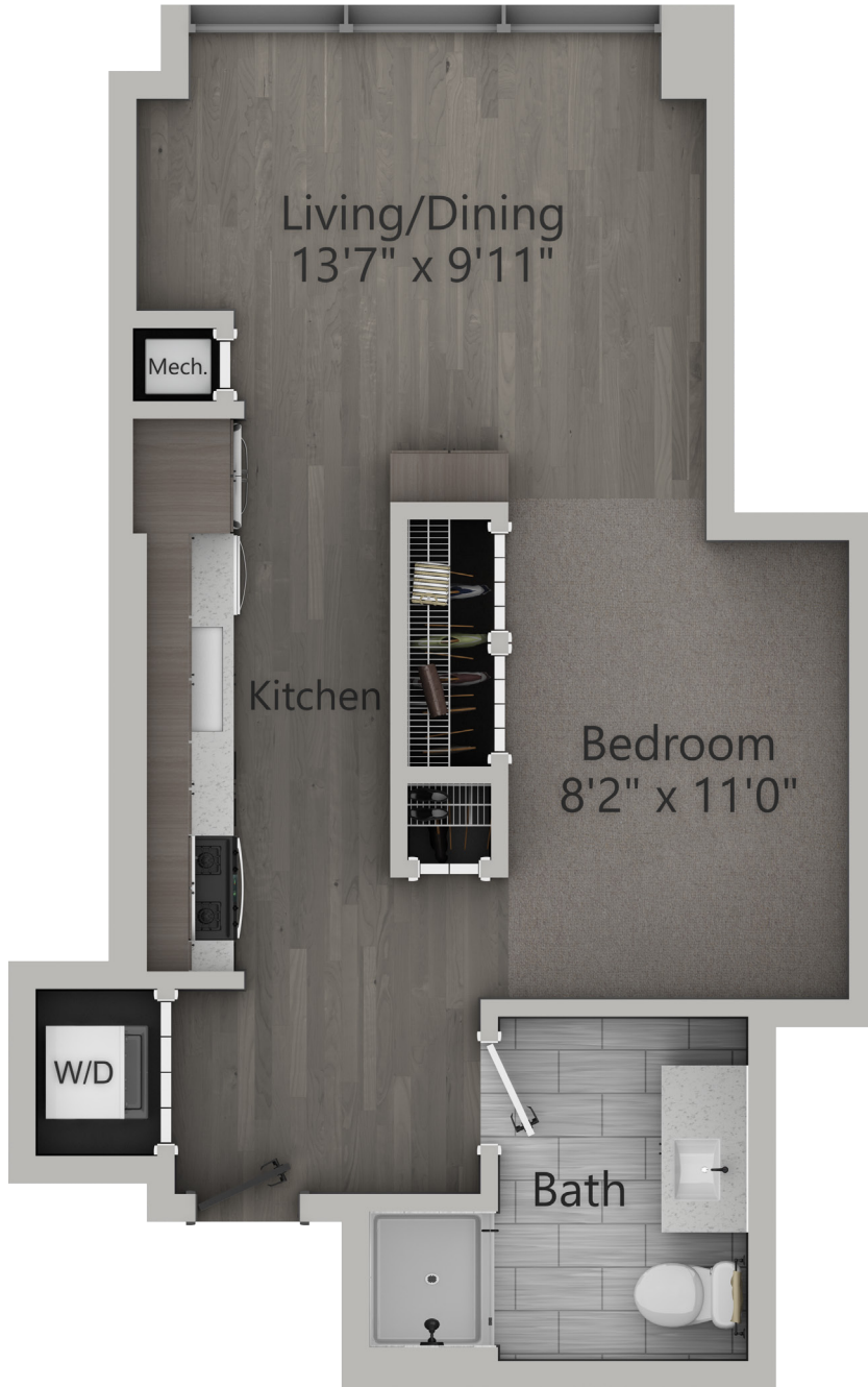
FLOOR 3 N▶